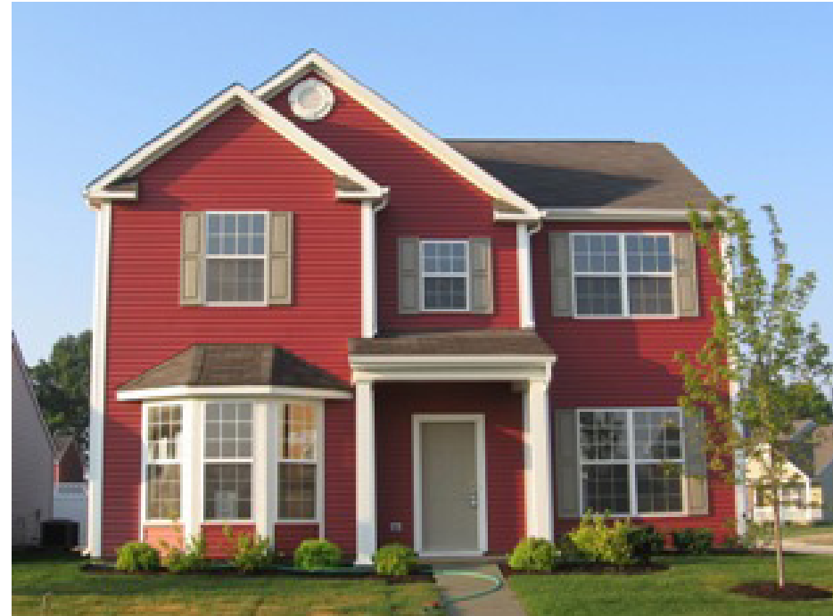
Parcel W: Carriage Manor