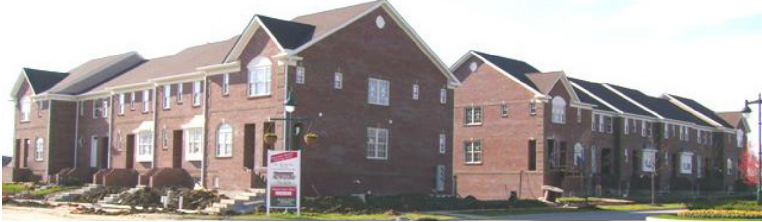
Parcel LL: 131 Townhomes / Saxony Townhomes