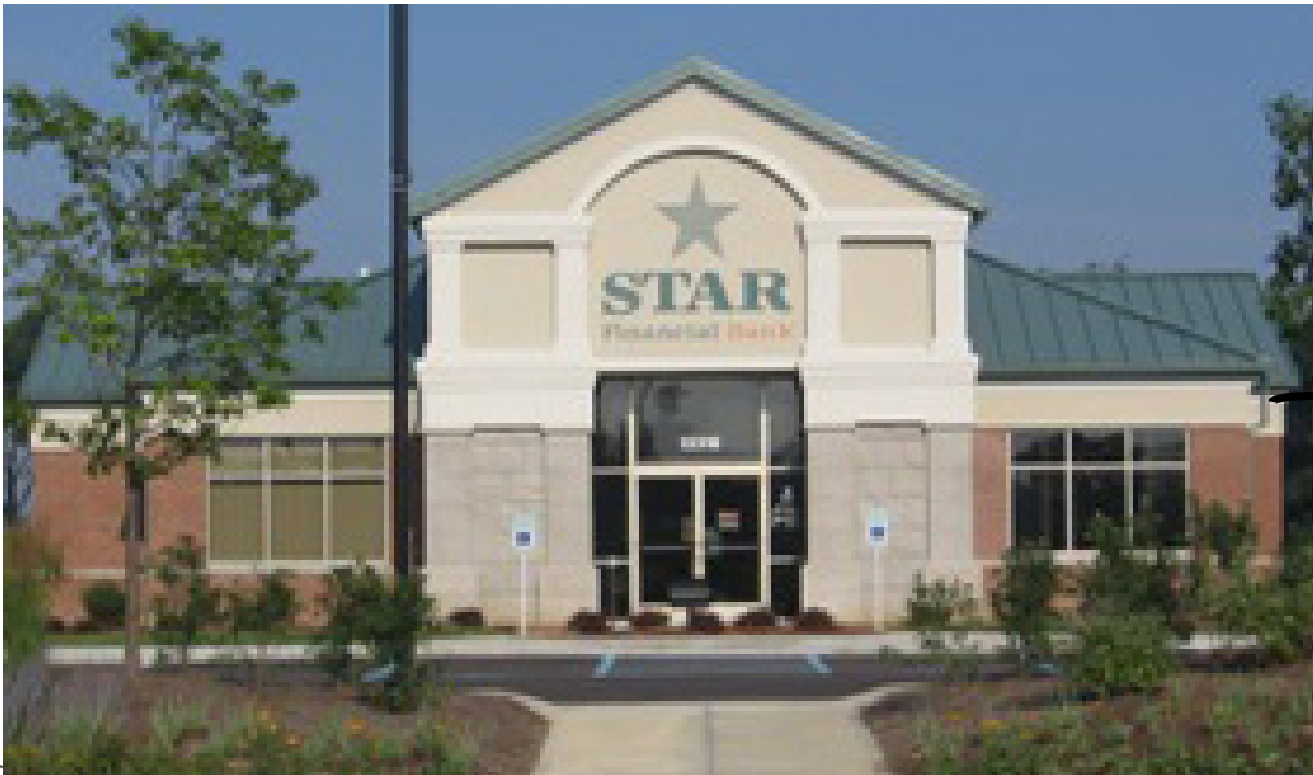
Parcel RR: Star Financial