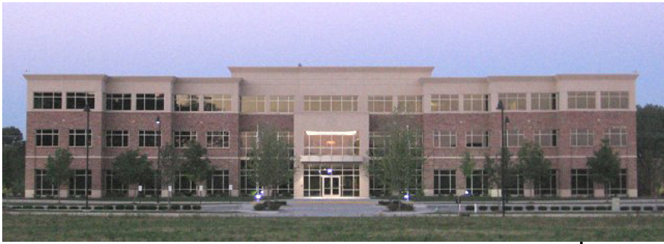
Parcel QQ: Wesleyan Headquarters