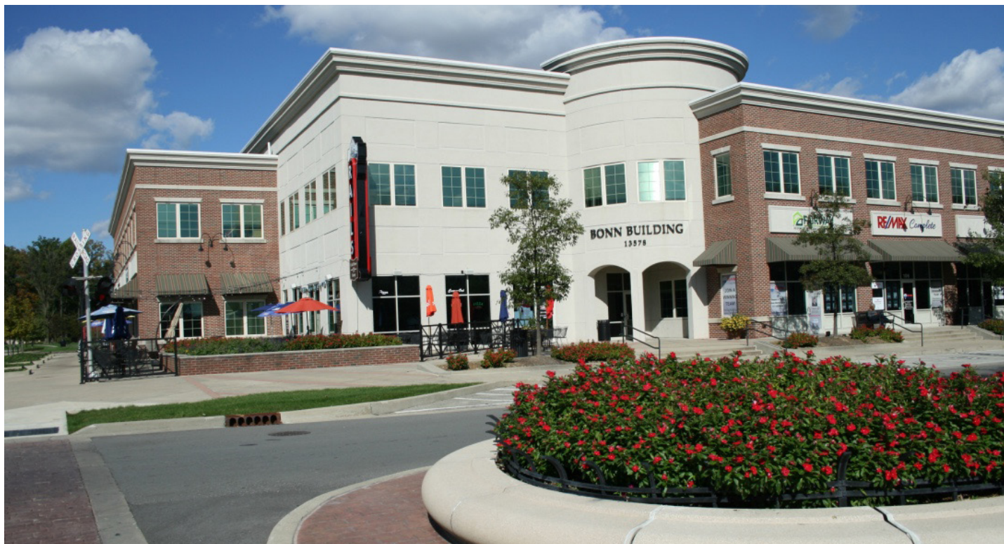
Parcel JJ: Bonn Building