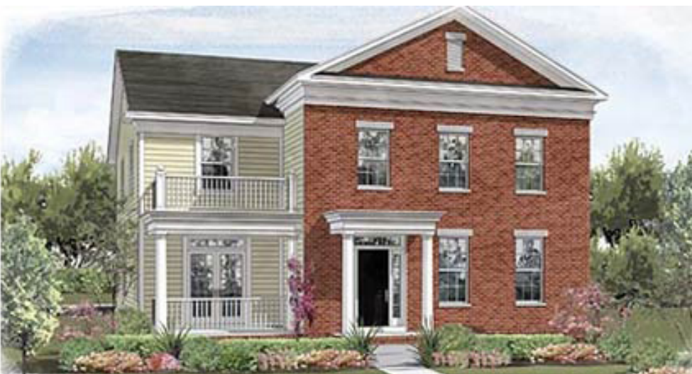
Parcel DDD: The Heritage