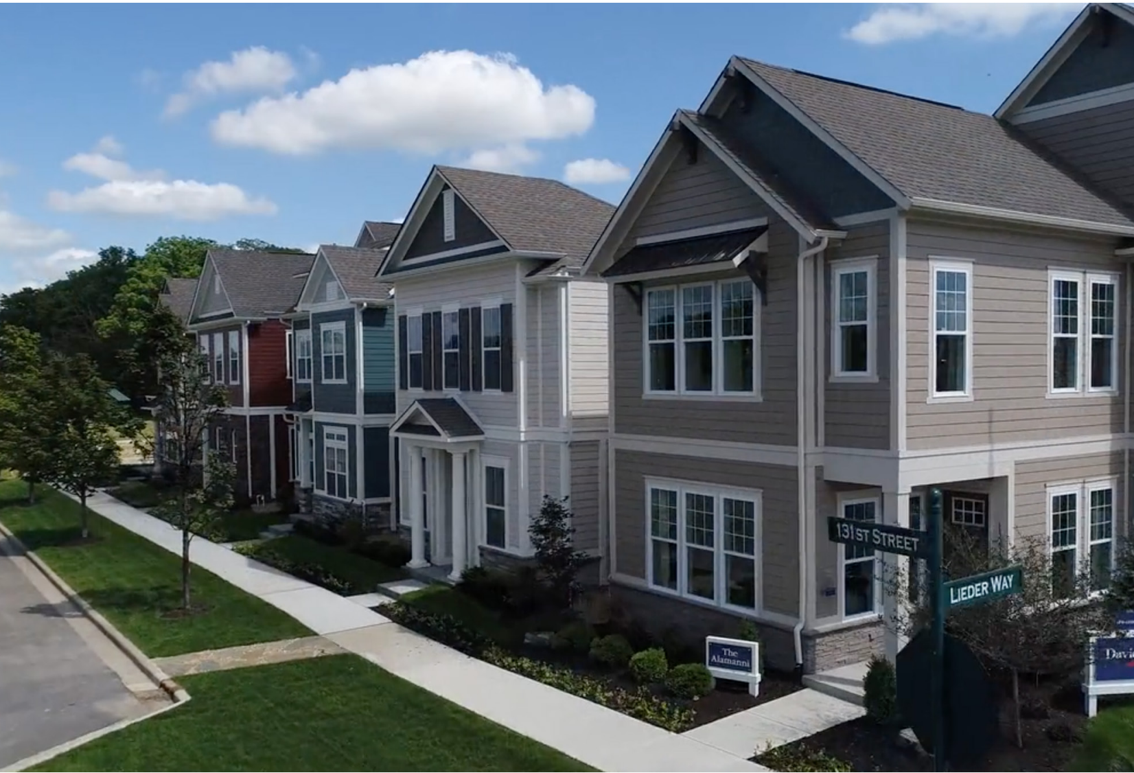
Parcel CC-DD: The Villas at Saxony