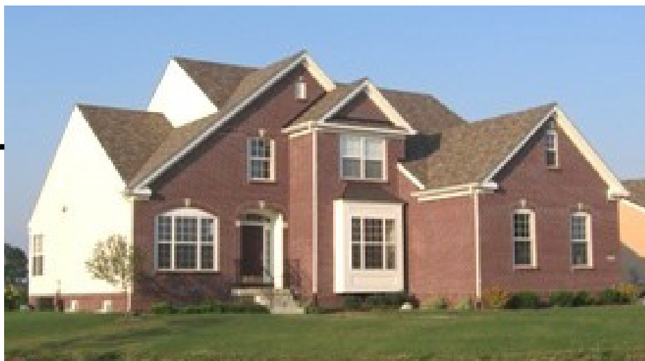
Parcel FFF: The Traditions