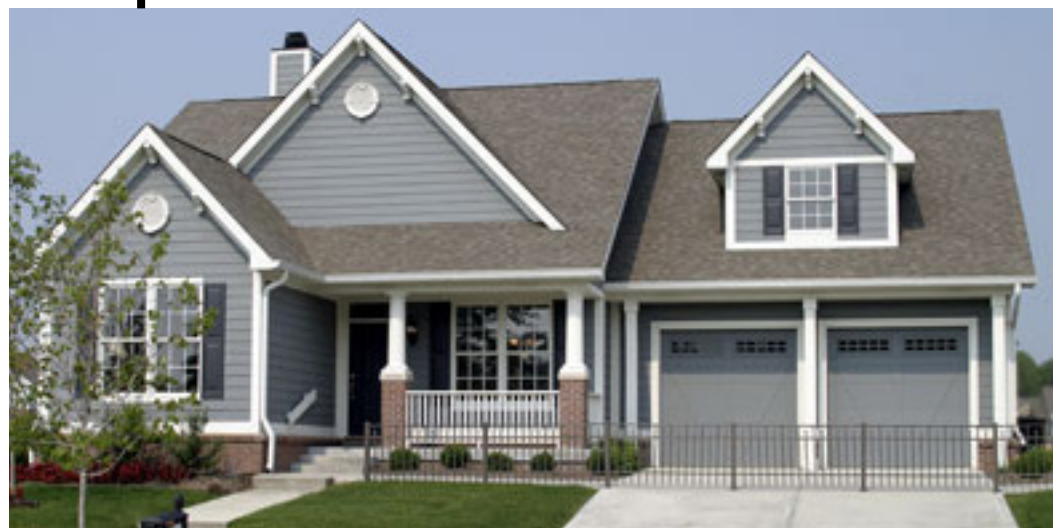
Parcel EEE: The Cottages