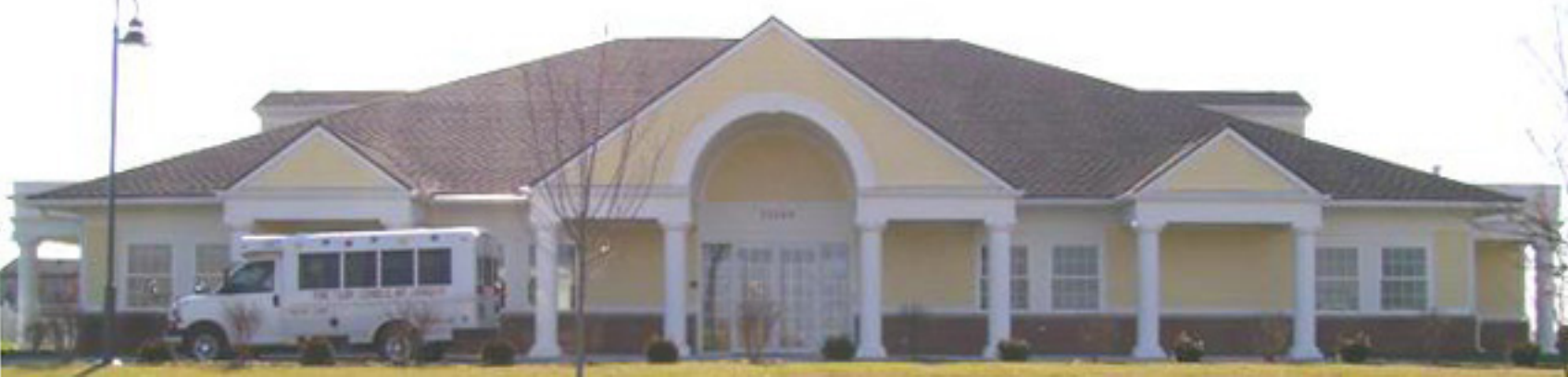
Parcel X: Playschool