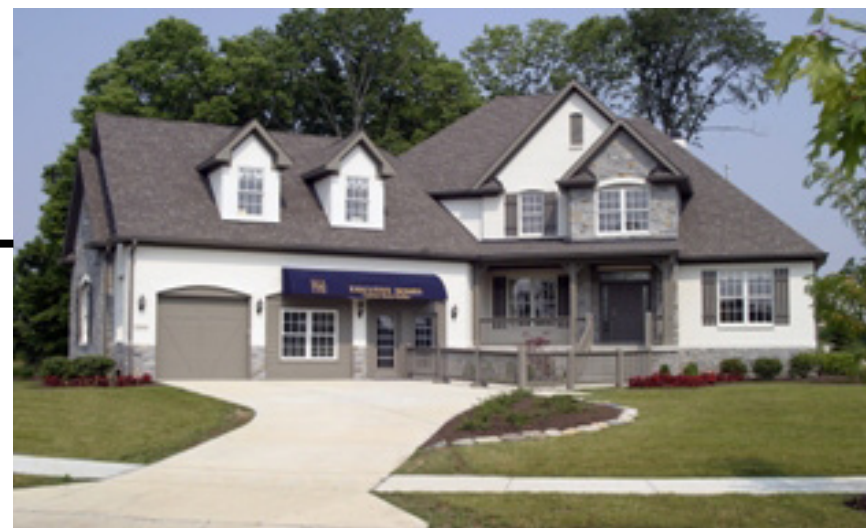
Parcel GGG: The Reserve